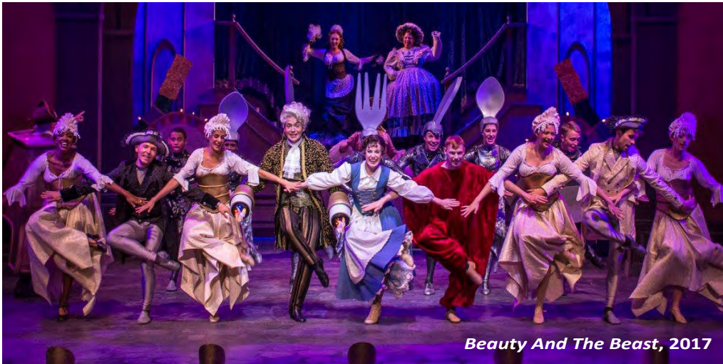
Beauty And The Beast, 2017

Target the population of mid-Missouri who “go out” for their entertainment, who enjoy many of the finer things in life; automobiles, furnishings, electronics, etc. and also enjoy dining out, travel and other leisure activities.