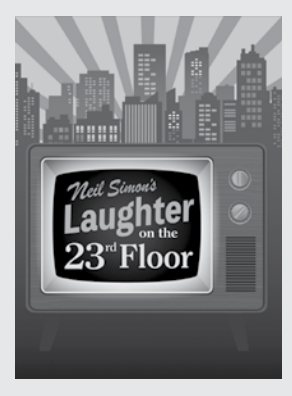
Aug 18 - Aug 27