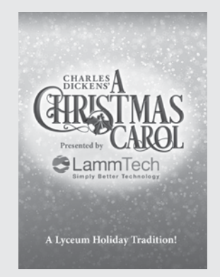
Plus our 9th Annual Production of A Christmas Carol!