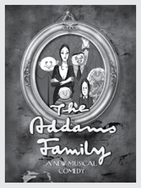
Jun 9 - Jun 18