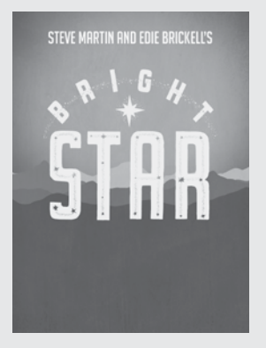
Sep 29 - Oct 8