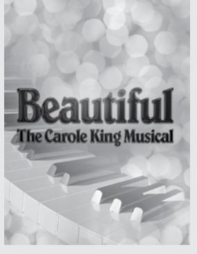
Jun 30 - Jul 9